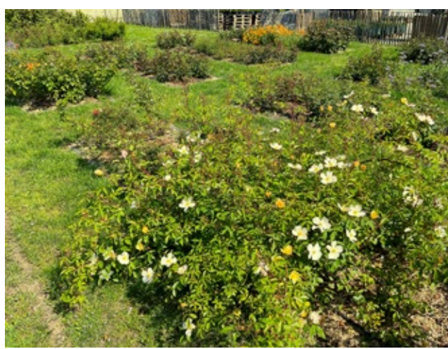
The mulch previously tested has now been applied to all cultivation squares - Only a few varieties were in bloom in mid-May - ©Jean-Luc Pasquier

Today, the rose garden is looking forward to a 4th edition as promising as the first three. The competition will be held on Saturday June 17 for the international jury and invitees. The international jury will complete the 7 2022-2023 judgements of the permanent jury on the 16 large-flowered (hybrid teas), 24 grouped-flowered (floribunda/multiflora) and 6 miniature varieties; plus the 12 2021-2023 judgements on the 9 landscape, 4 ground-cover and 9 climbing varieties. The international jury will judge 68 candidates from 24 breeders from 11 countries (France, Germany, South Africa, New Zealand, China, USA, Japan, Belgium, Switzerland, Italy, Denmark). This year's jury will comprise some 60 members, including an exceptional delegation from Japan, China, South Korea, Uruguay, Australia, New Zealand, India and Canada, who attended the 15th International "Heritage Rose" Convention in Brussels in early June.