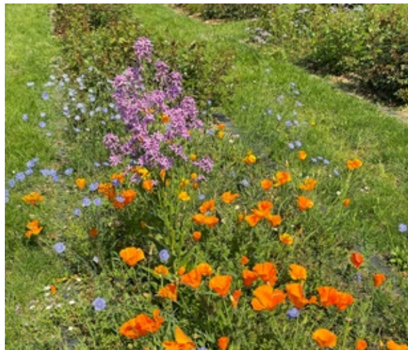
The unoccupied squares are sown with wildflowers to enhance the rose garden's biodiversity